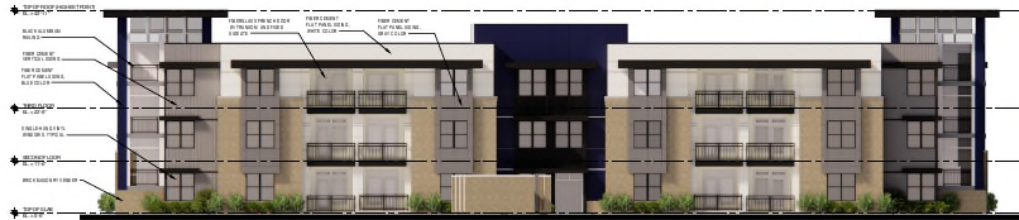
TYPICAL FRONT ELEVATION (NORTHEAST)