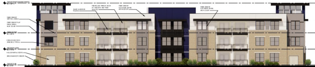
TYPICAL REAR ELEVATION (SOUTHWEST)