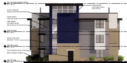
TYPICAL SIDE ELEVATION