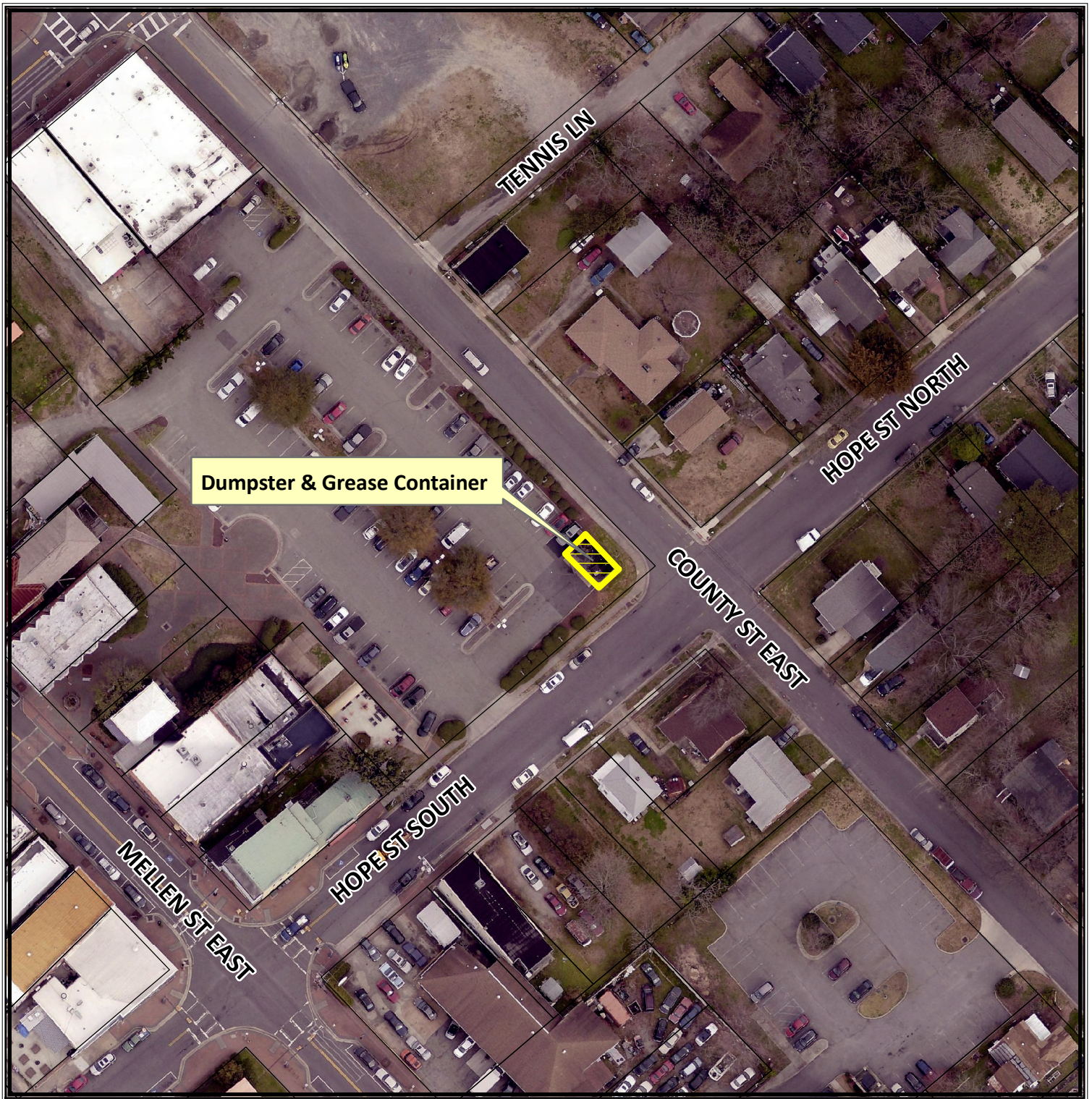
Exhibit "A" for Licensed Improvement

Prepared by: CITY of HAMPTON Dept. of Public Works - Engineering Services