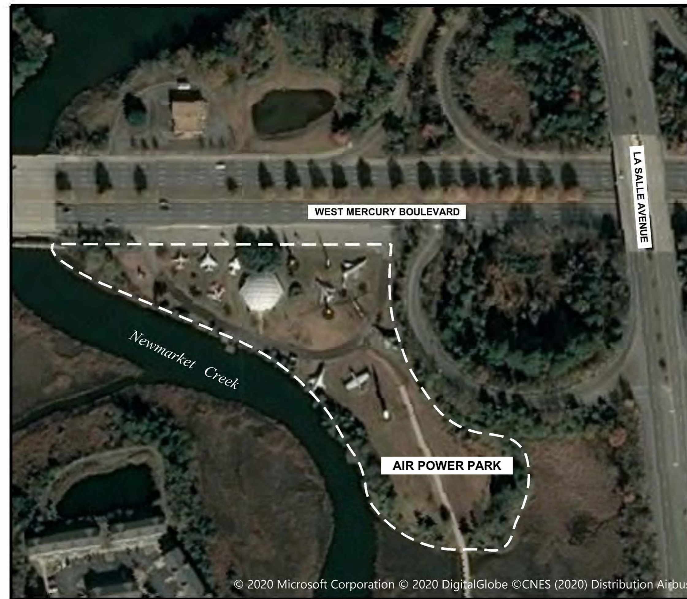
LOCATION MAP SCALE: 1"=120'