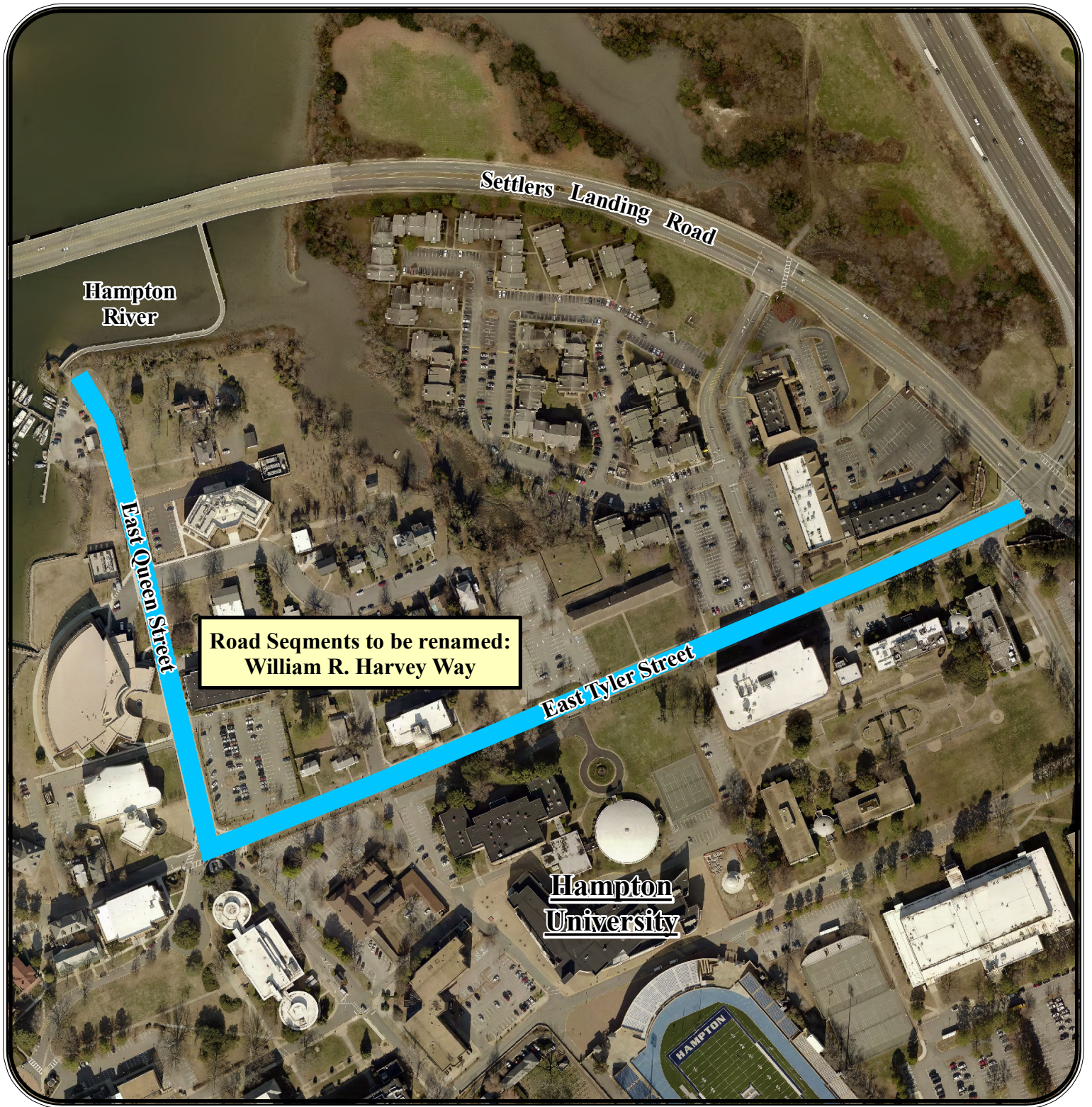
Exhibit Denoting Renaming of East Tyler Street and East Queen Street to William R. Harvey Way

Prepared by: CITY of HAMPTON Dept. of Public Works - Engineering Services