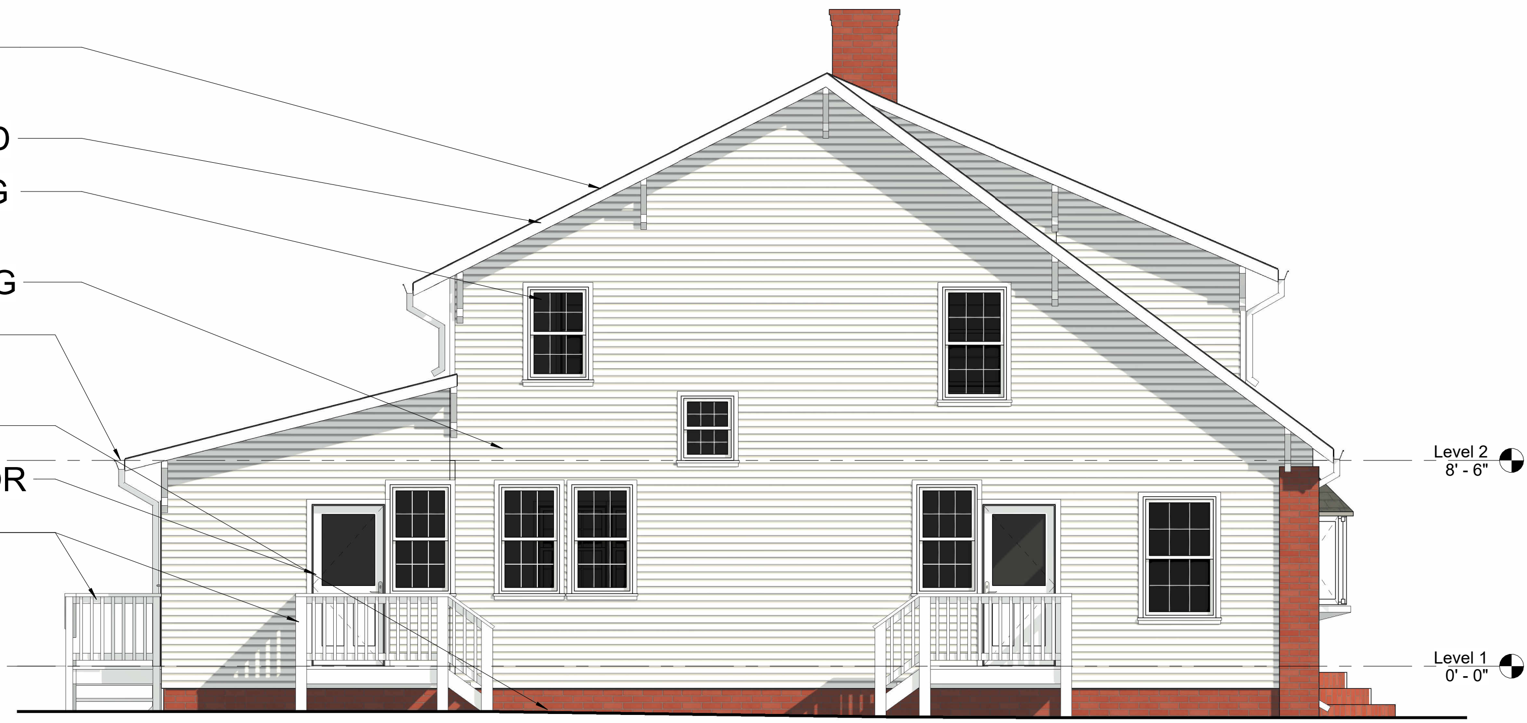
② EAST ELEV 1/4" = 1'-0"