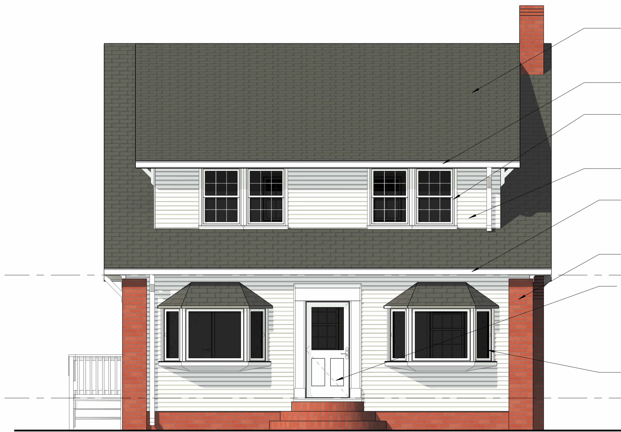
① NORTH ELEV 1/4" = 1'-0"