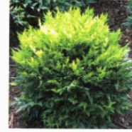
Nandina 'Lemon Lime'