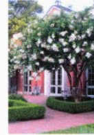
Crape Myrtle 'Natchez'