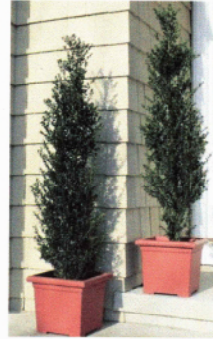
Holly 'Patti O Box'