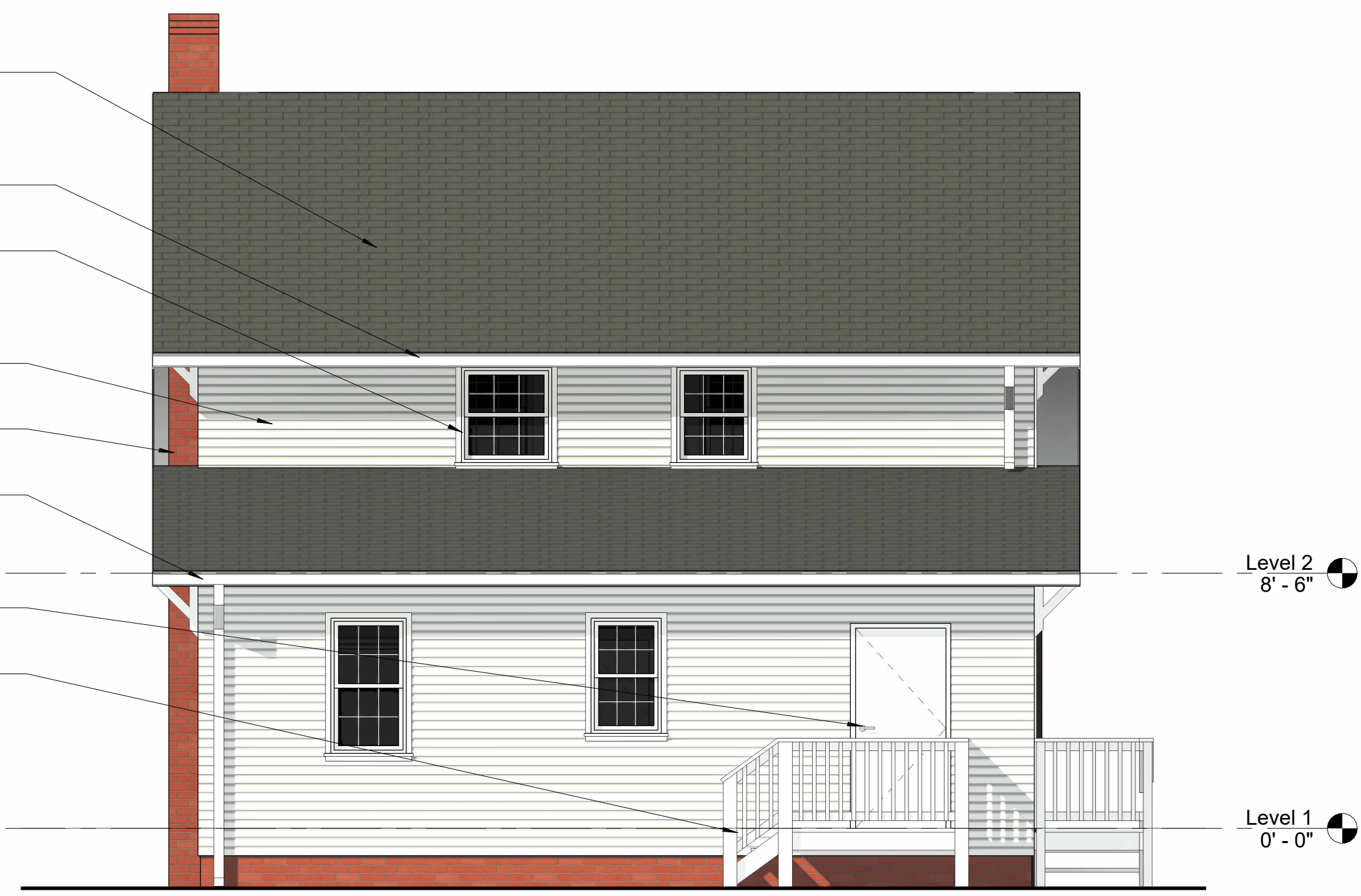
④ SOUTH ELEV 1/4" = 1'-0"