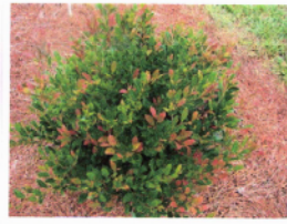
Distylium 'First Editions Coppertone'