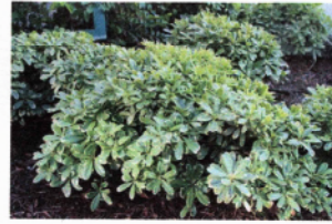
Pittosporum 'Crème de Mint'