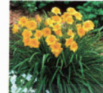
Daylily 'Stella De Oro'