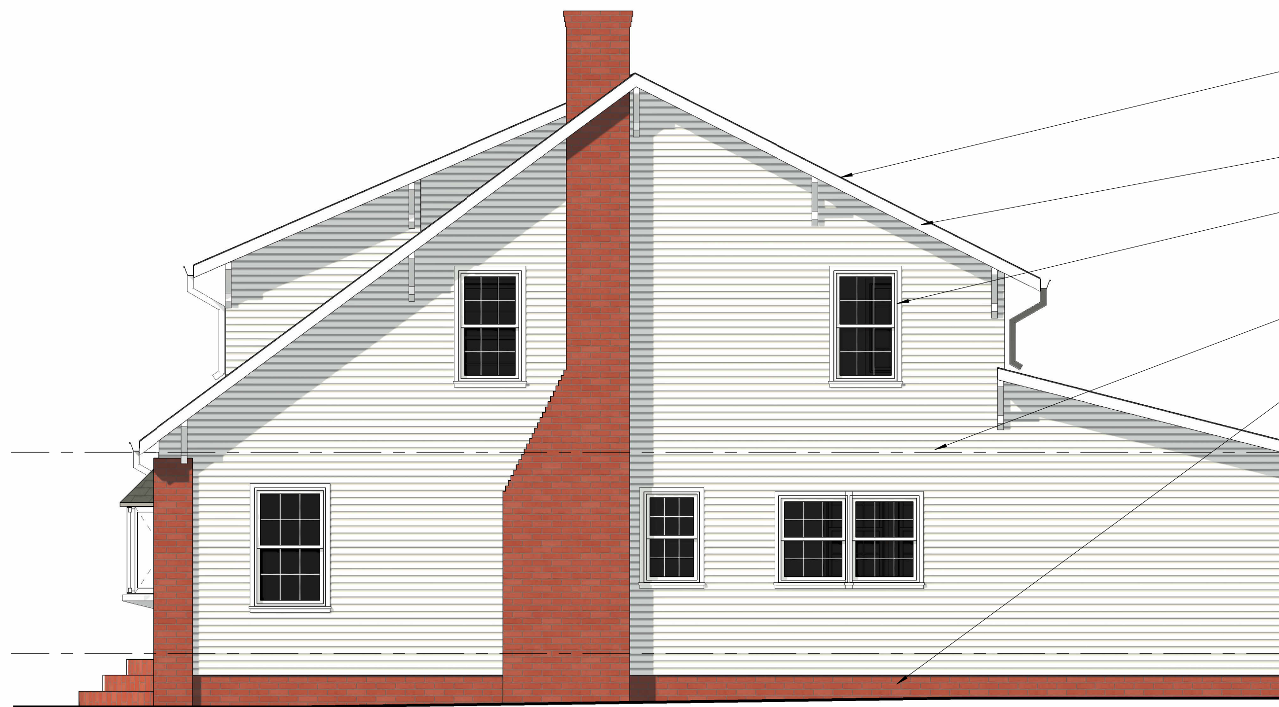
③ WEST ELEV 1/4" = 1'-0"