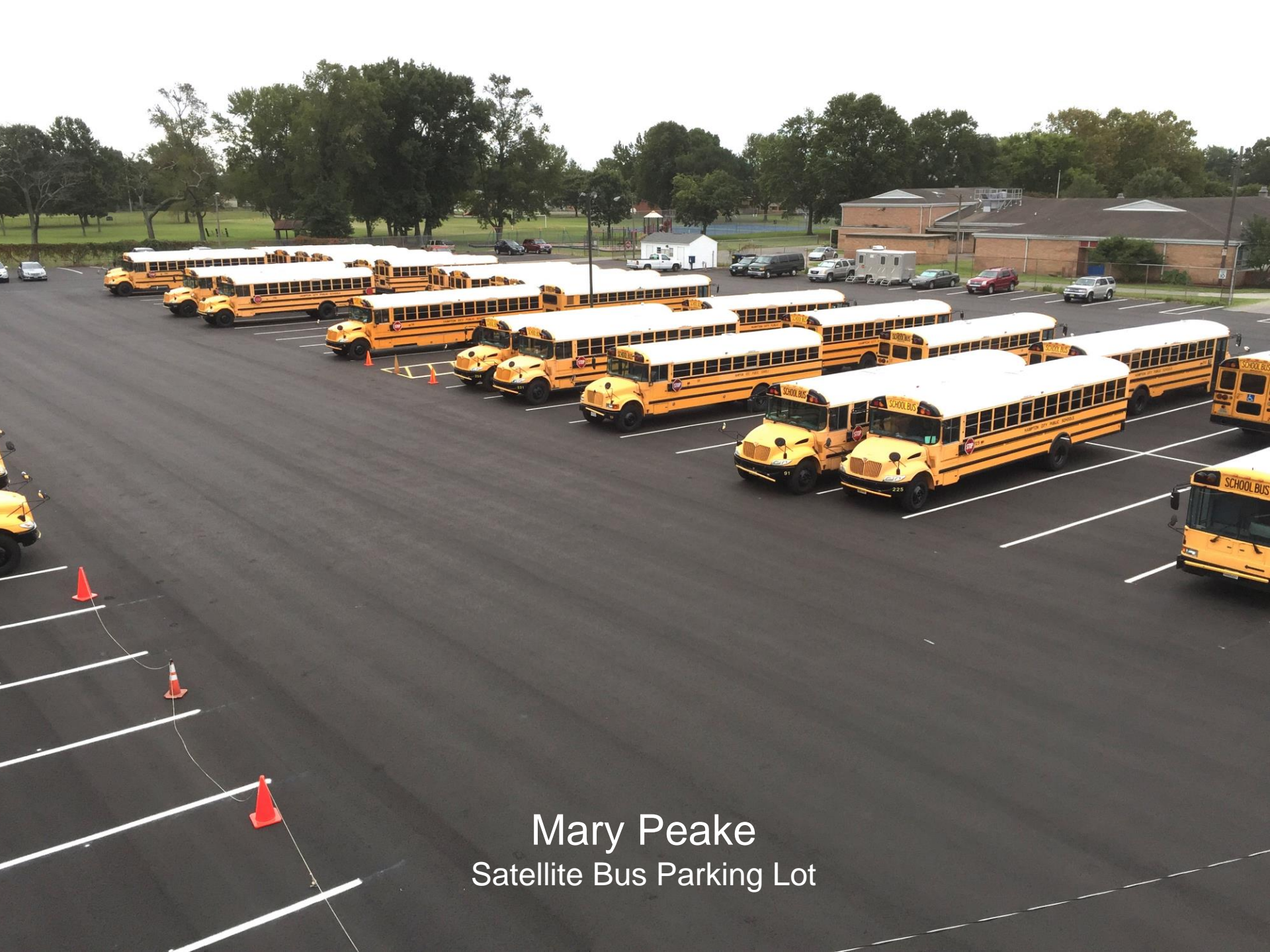
Mary Peake Satellite Bus Parking Lot