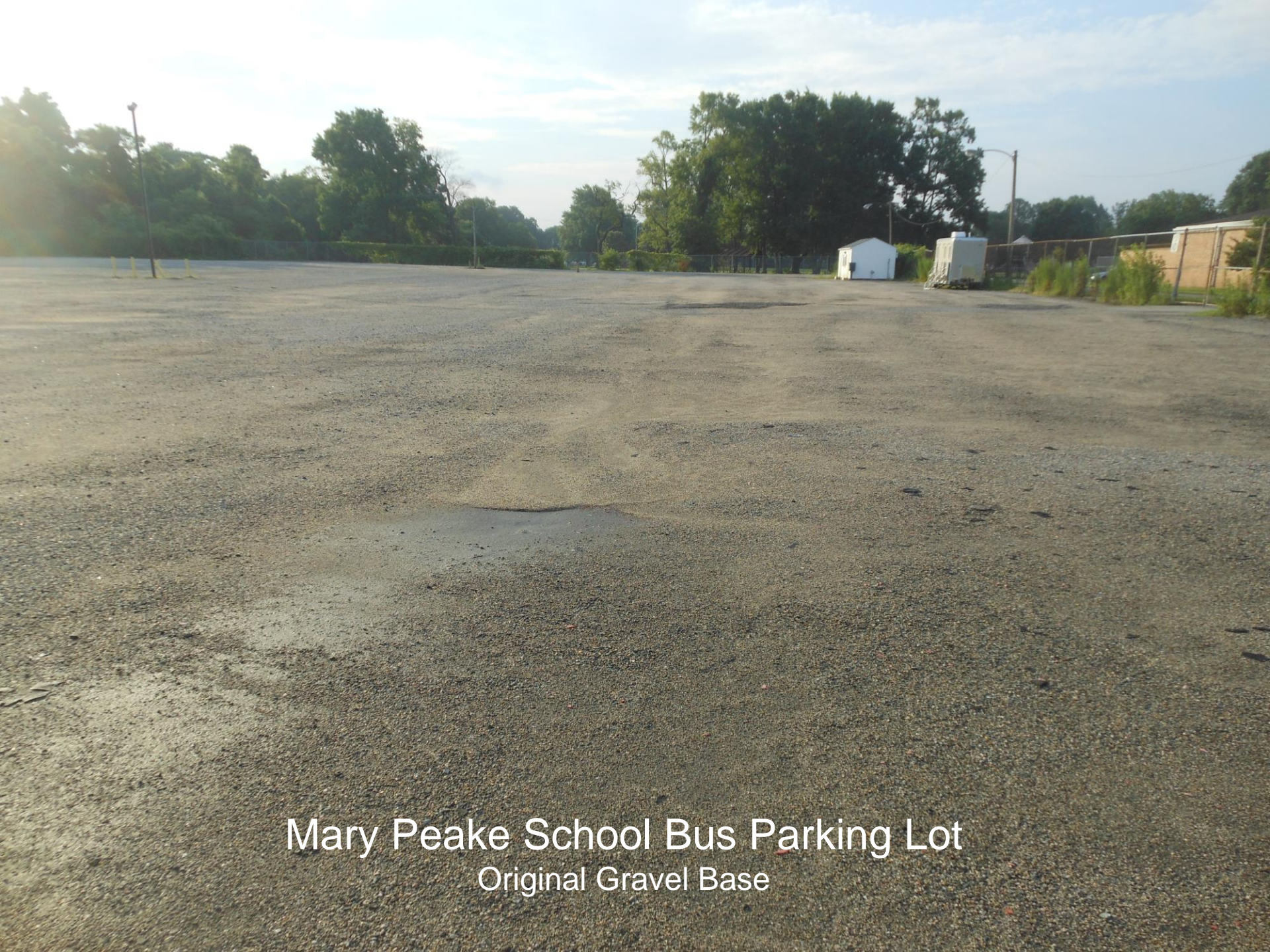
Mary Peake School Bus Parking Lot Original Gravel Base