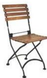
Figure 18. Folding bistro chairs take up minimal space and come in a variety of materials.