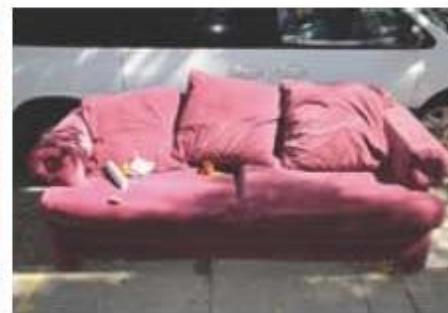
Figures 20 & 21. Indoor upholstery furnishings are not permitted as outdoor seating.