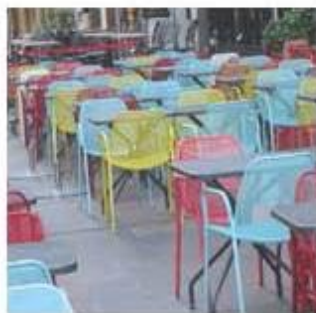
Figure 19. Finished metal chairs may be selected in a variety of colors and styles.