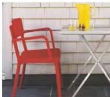
Figure 17. Durable high quality plastic chairs are appropriate and can be obtained in many colors.