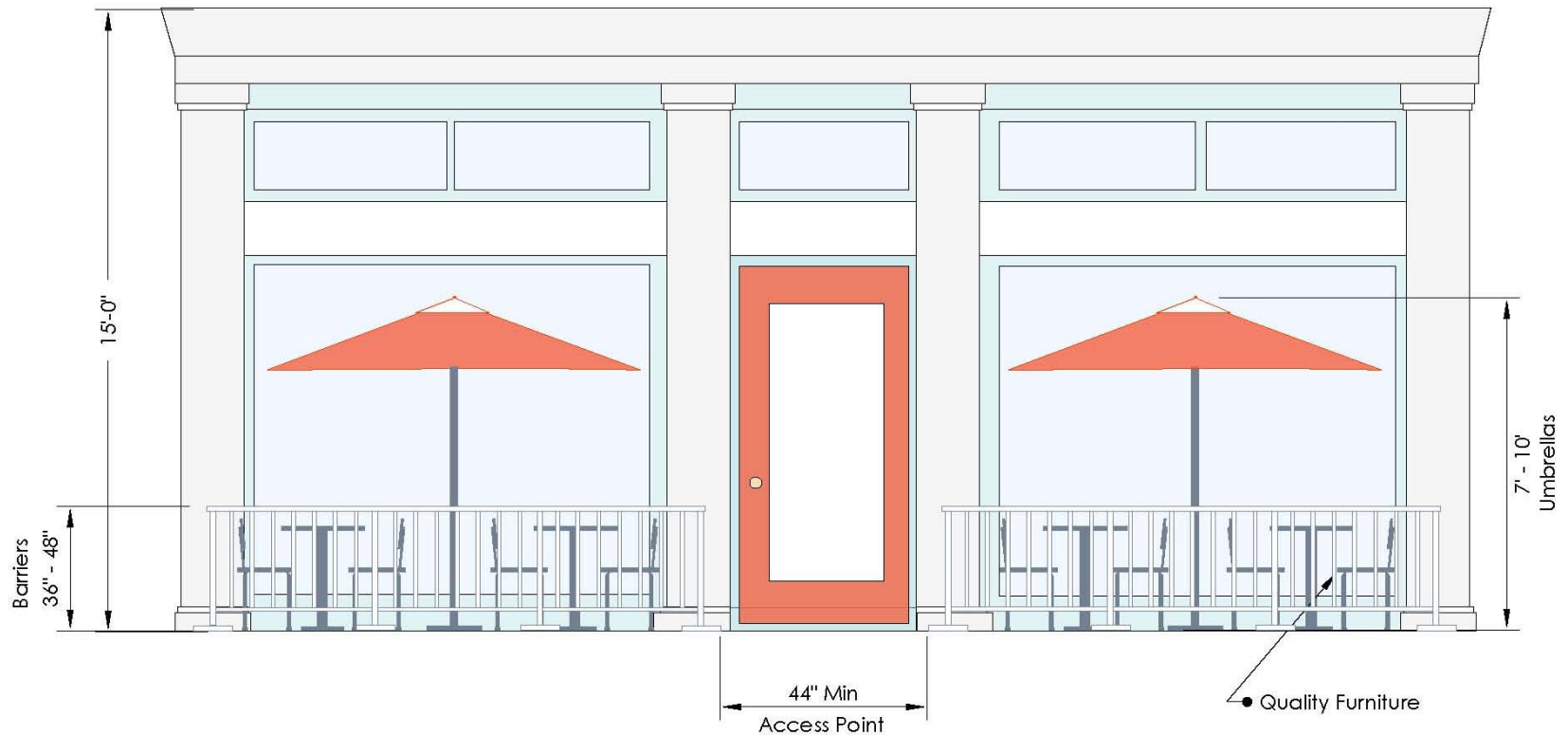
Diagram 1. Outdoor seating areas should provide quality furniture, must have barriers between diners and the public right of way, and typically have amenities such as umbrellas and planters to enhance the dining space.