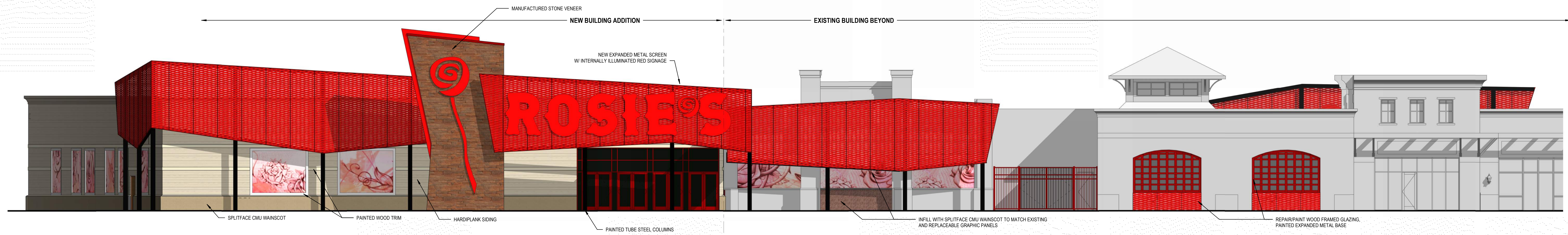
1 S ELEVATION 1/8" = 1'-0"