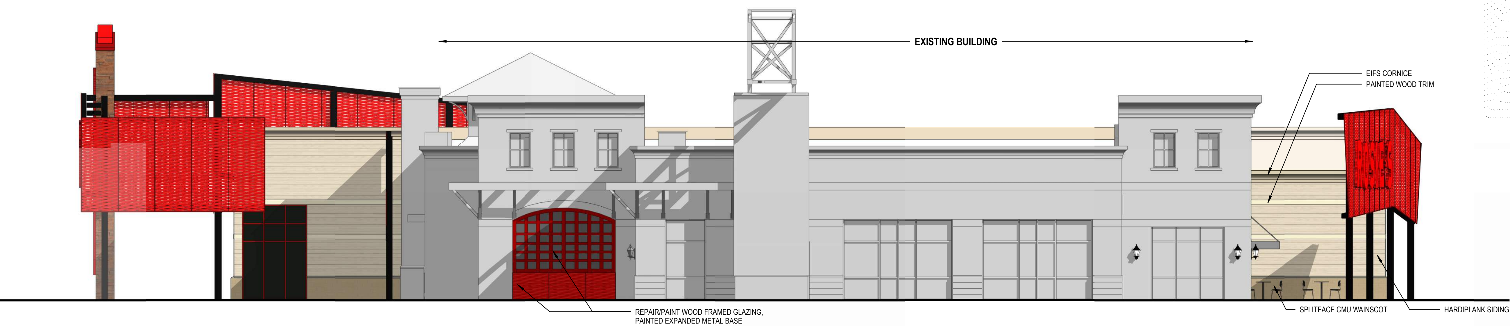
4 E ELEVATION 1/8" = 1'-0"