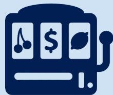
Skill Games SB661/HB1272