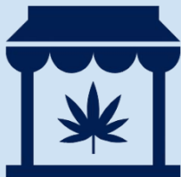
Retail Cannabis SB452/HB642