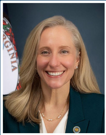
Governor Abigail Spanberger (D)