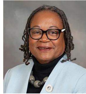
Senator Mamie Locke District 23