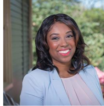
Senator Lashrecse Aird Henrico County