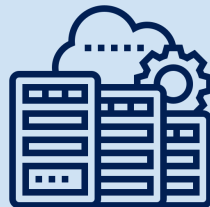
Data Centers Budget