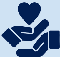
Paid Family Medical Leave SB2/HB1207