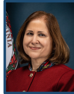
Lieutenant Governor Ghazala Hashmi (D)