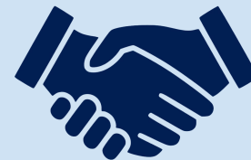
Collective Bargaining SB378/HB1263