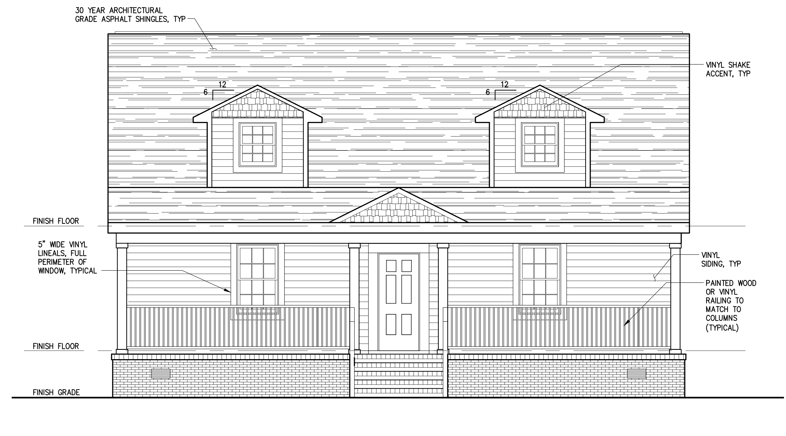
EXTERIOR ELEVATION - FRONT