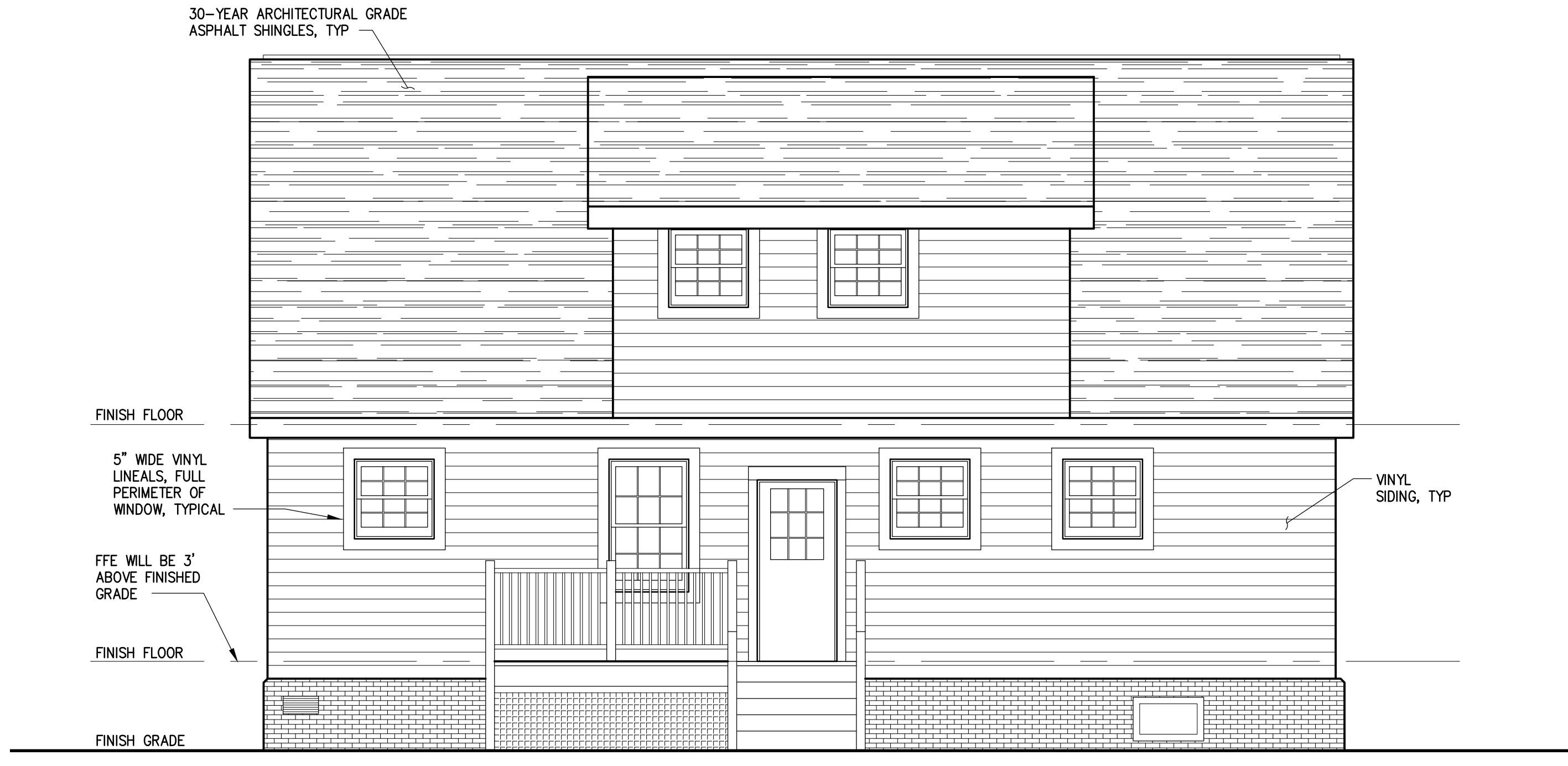
EXTERIOR ELEVATION - REAR