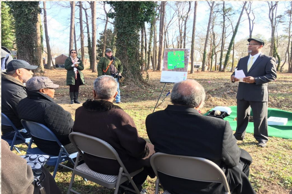
AT TUCKER CEMETERY, JAN 2018