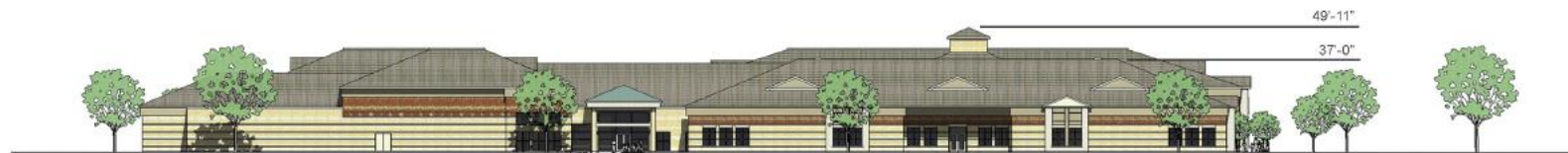
EAST ELEVATION: NTS