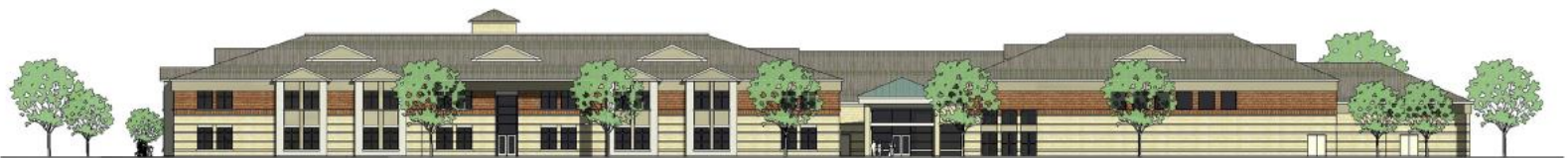
WEST ELEVATION: NTS

MOSELEYARCHITECTS A PROFESSIONAL CORPORATION