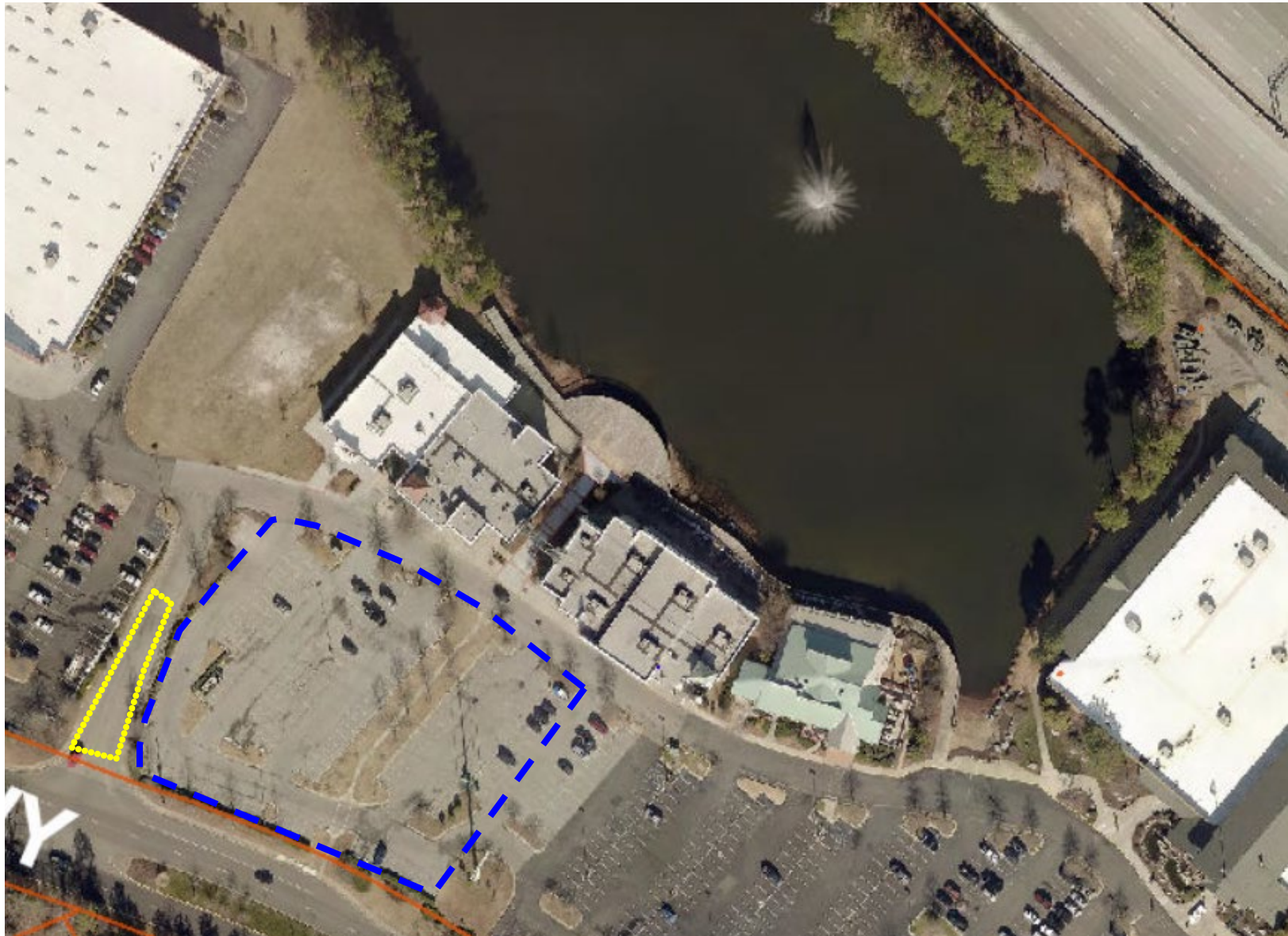
Exhibit E – Parking Lot Boundary