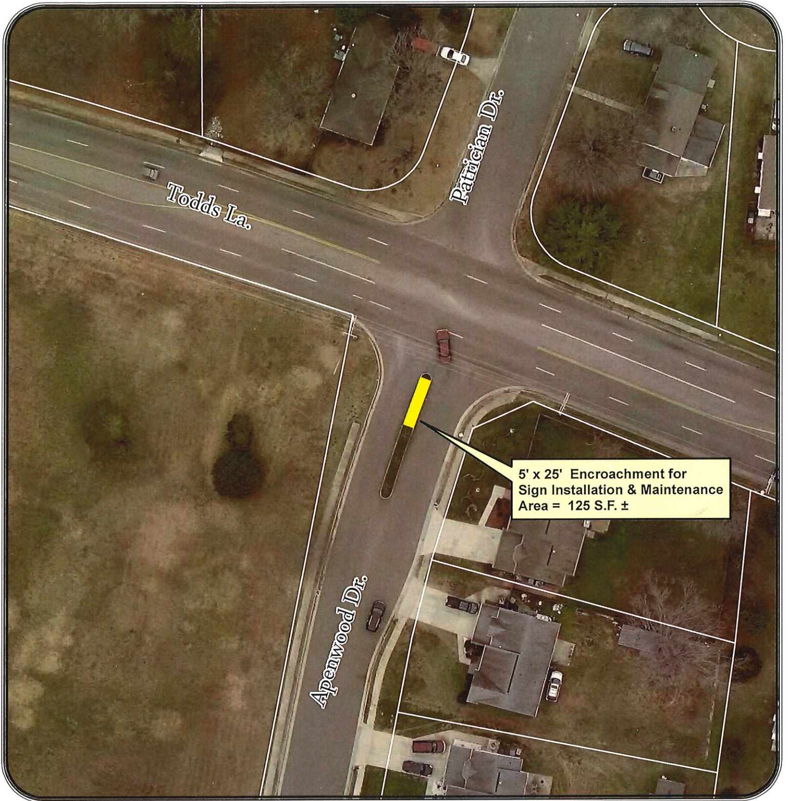
Exhibit "A" for Encroachment Granted to: Benjamin's Landing HOA at Benjamin's Landing Subdivision

Prepared by: CITY of HAMPTON Dept. of Public Works - Engineering Services