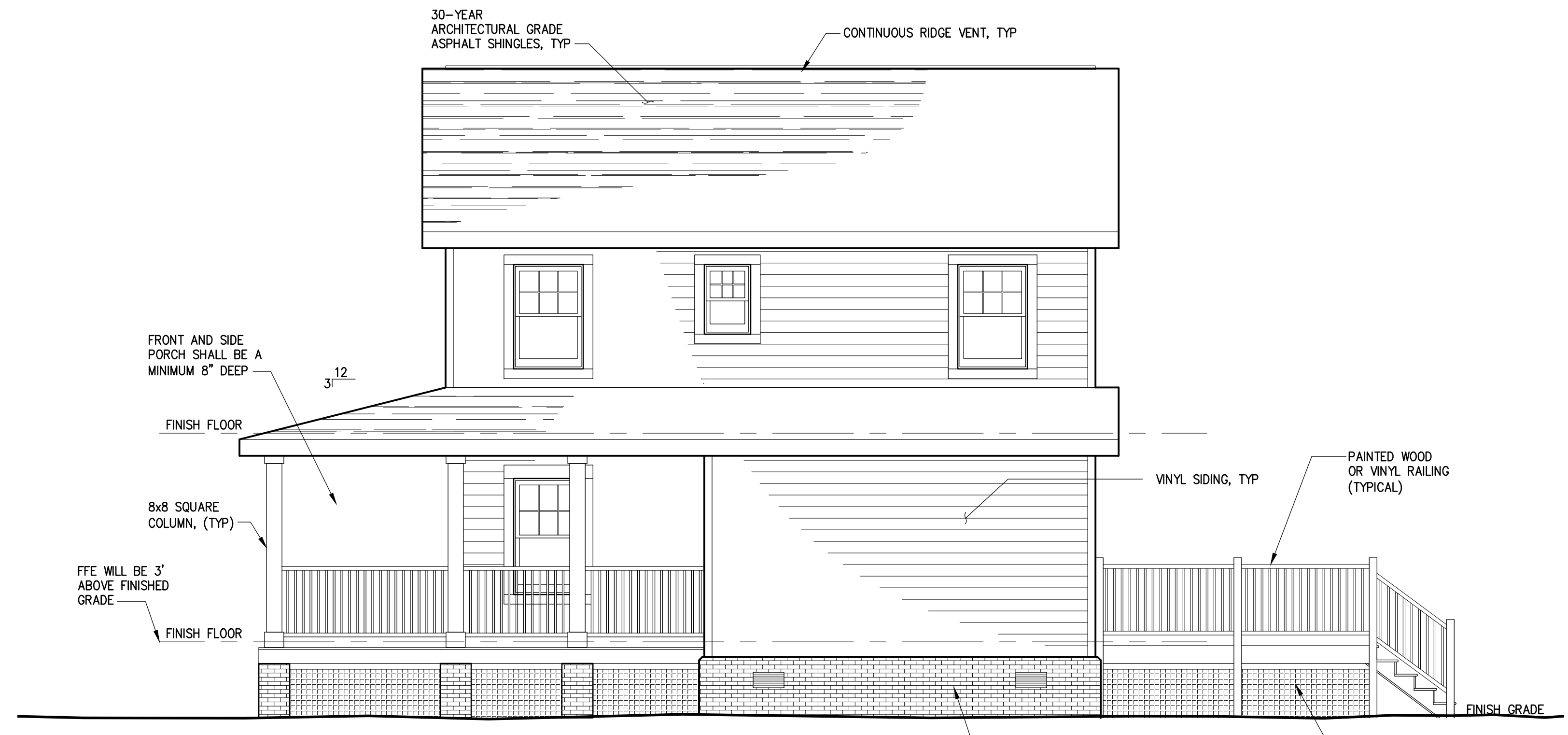
EXTERIOR ELEVATION - SIDE SCALE: 1/4" = 1'-0"