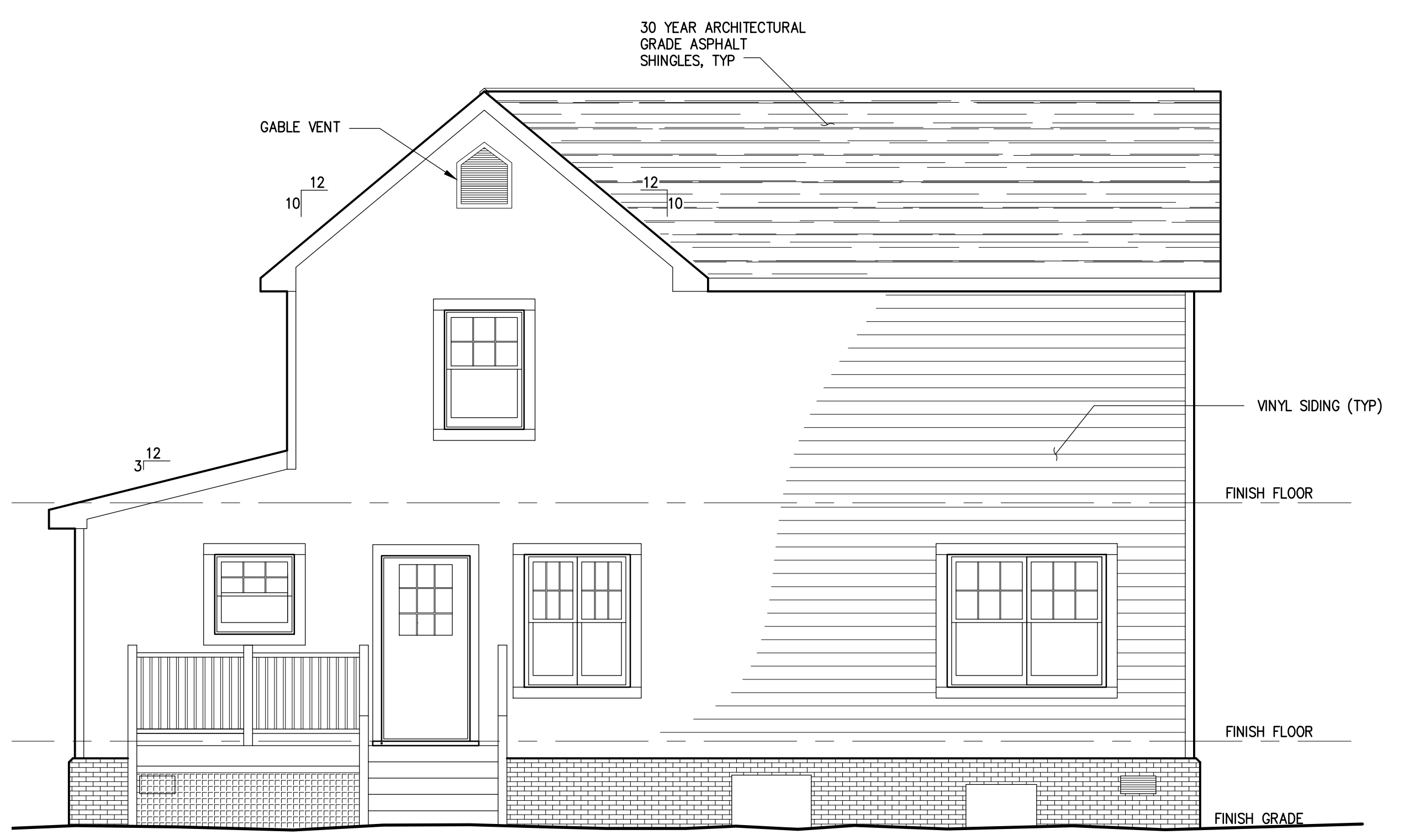
EXTERIOR ELEVATION - REAR SCALE: 1/4" = 1'-0"