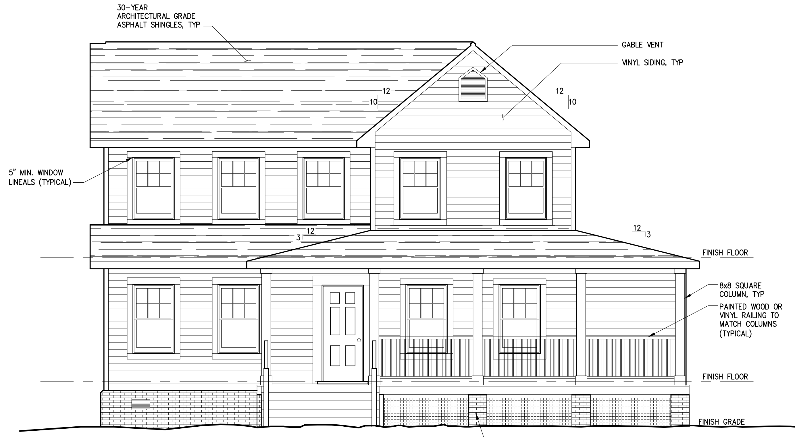
EXTERIOR ELEVATION - FRONT SCALE: 1/4" = 1'-0"