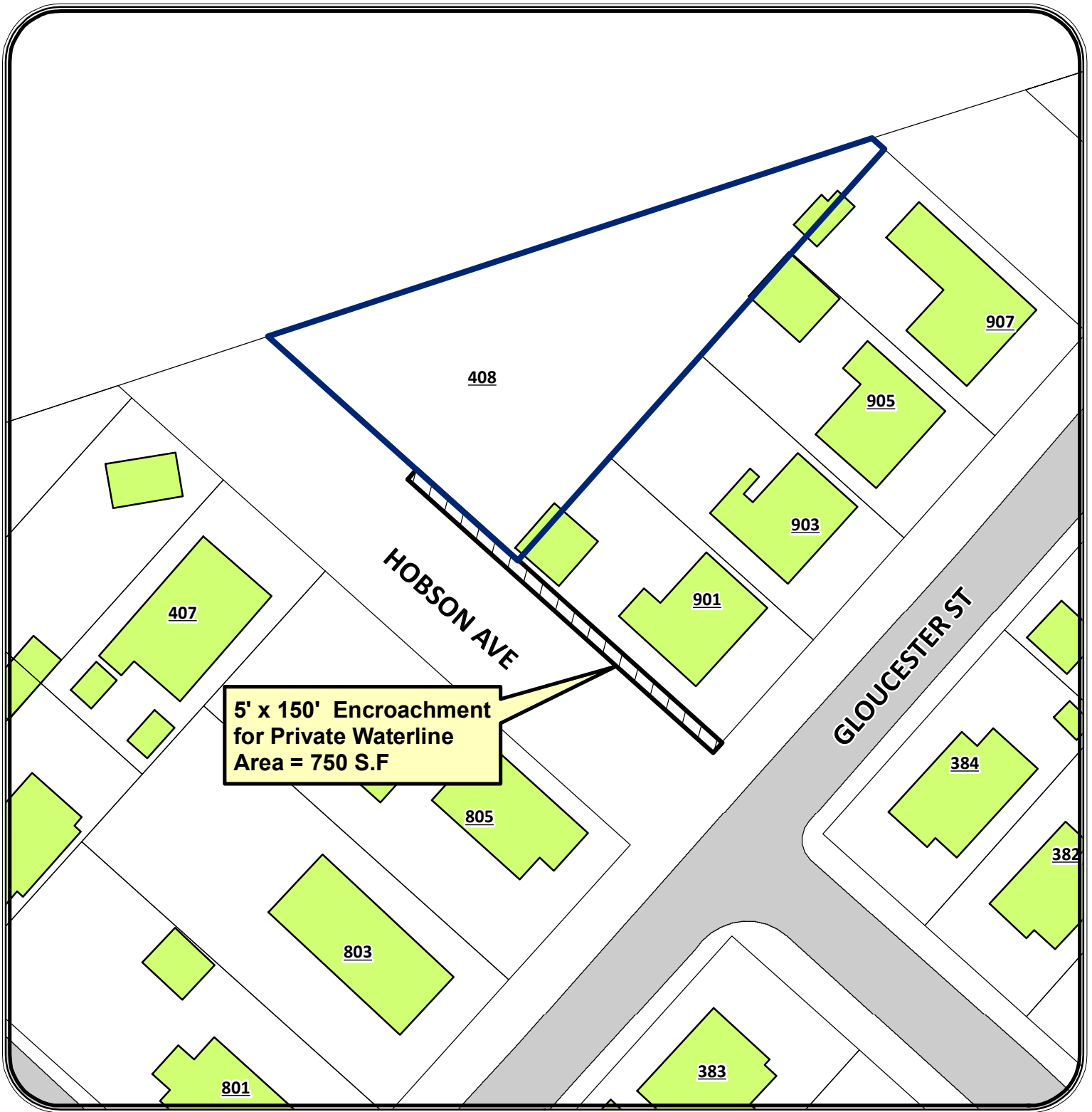
Exhibit for Encroachment Granted to: 408 Hobson Avenue

Prepared by: CITY of HAMPTON Dept. of Public Works - Engineering Services