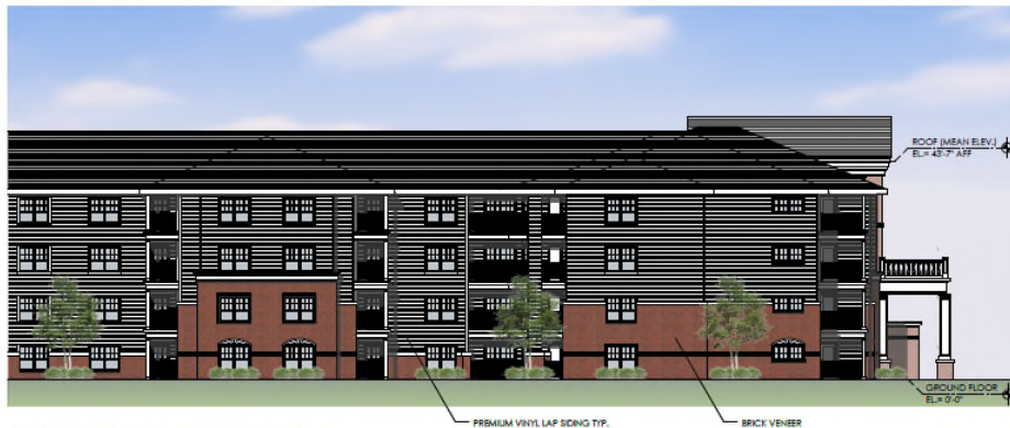
Partial Left Concept Elevation