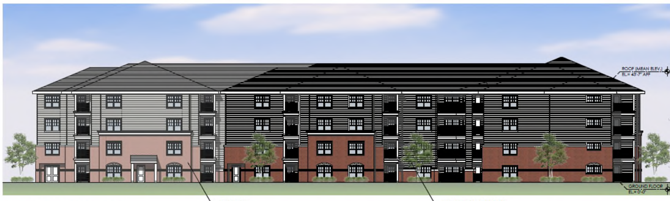
Rear Concept Elevation