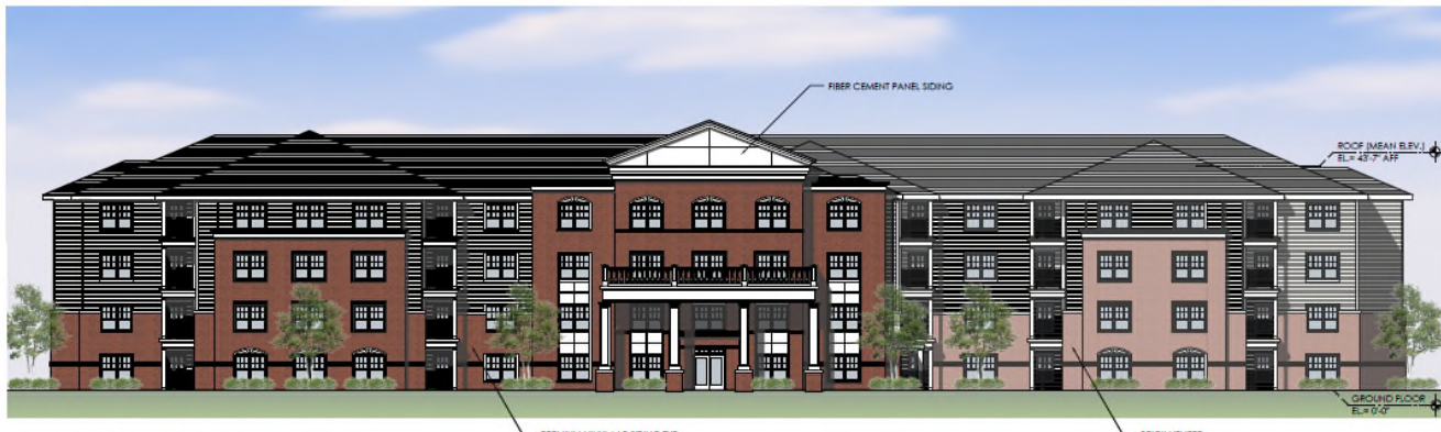
Front Concept Elevation