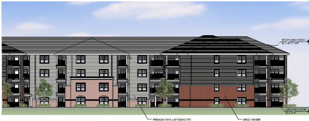
Partial Right Concept Elevation