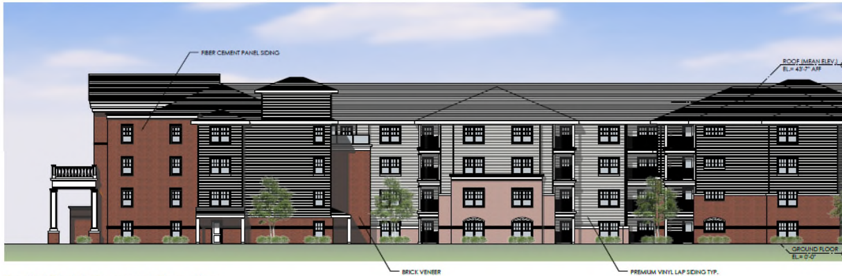
Partial Right Concept Elevation