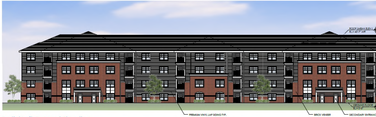
Partial Left Concept Elevation