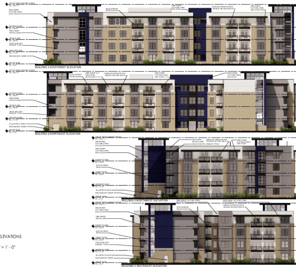
BUILDING 5 ELEVATIONS