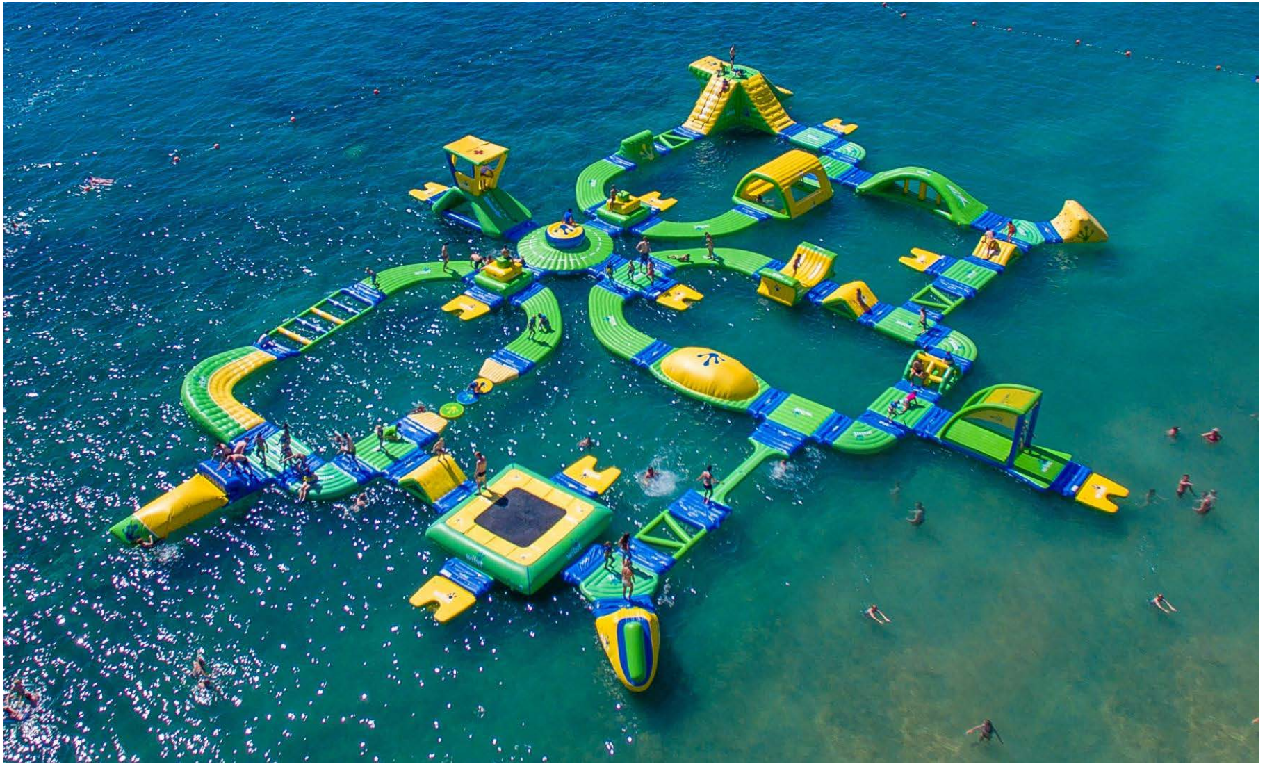
SPORTS PARK L