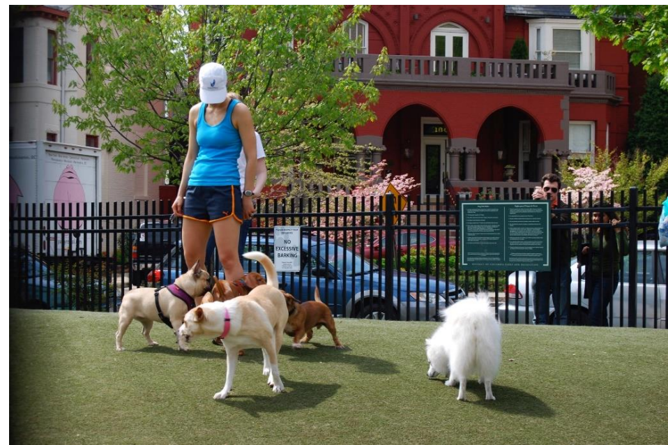
Dog Activity Area