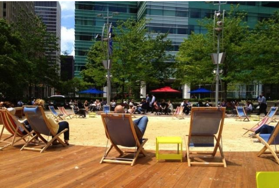
Urban Beach Area