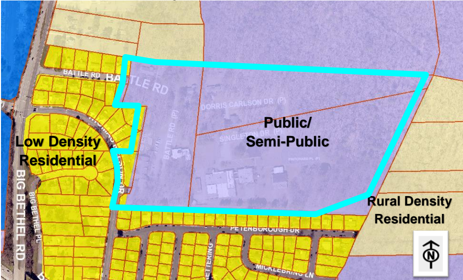
Page 5 of 11