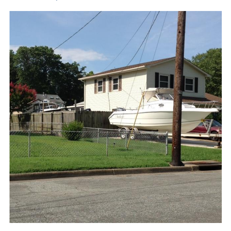
Meets current code