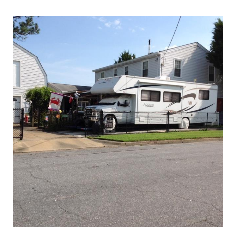
Meets current code