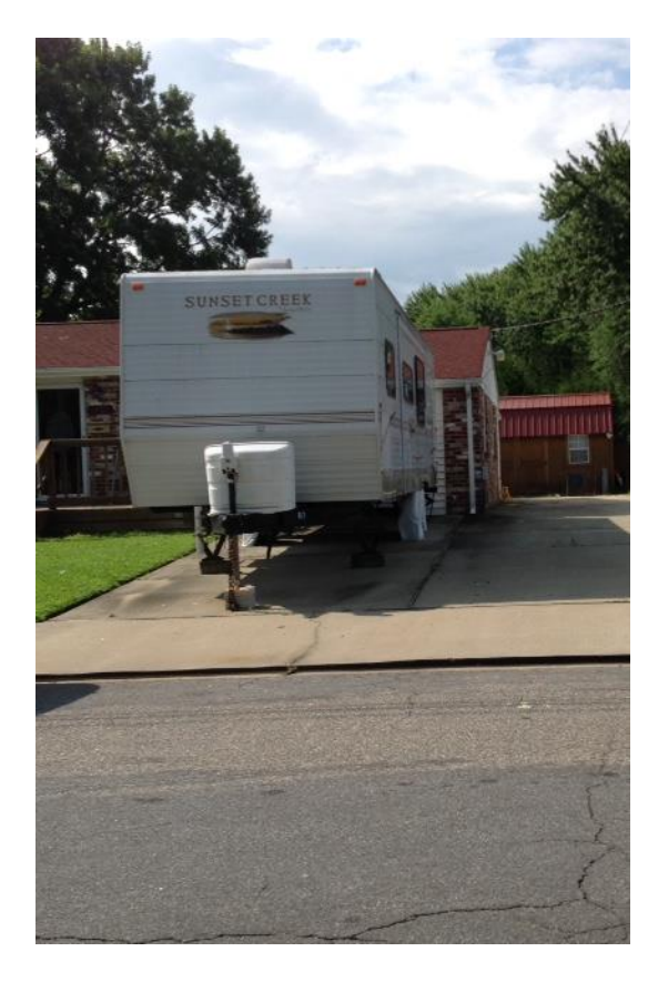
Meets current code